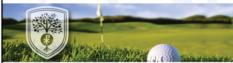
BLESSED SACRAMENT BOOSTERS

Thanks for your ongoing support & we hope to see you on the course!