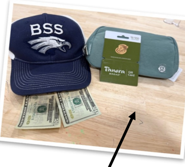
Each person in attendance has a chance to win these awesome prizes!