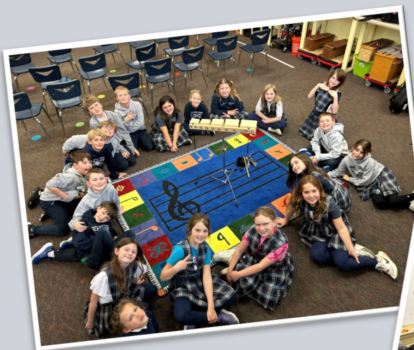
Development Committee's Wish List fulfillment continued last week with deliveries to the Music Room!

“Here are some pics of fun “Musical Toys” in action. I'm so grateful for all the support to the music program!!”