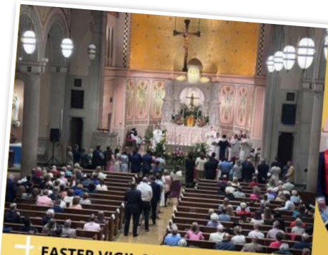
EASTER VIGIL 2026!! 11 BAPTISMS AND 21 CONFIRMATIONS!

PANCAKE BREAKFAST INCLUDES: PANCAKES, SAUSAGE OR BACON, MILK AND JUICE, ADULTS-$10.00 CHILDREN-$5.00