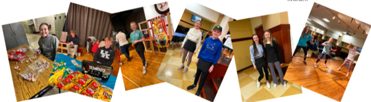
Student Council also organized games at Food Truck Night to fundraise! The younger students had so much fun playing the carnival games provided by the Schools' representatives!