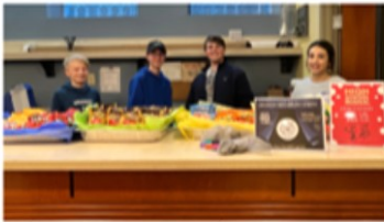
Student Council worked concession stands for the school musical!