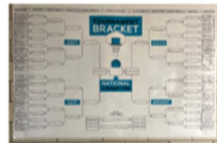
Congratulations to 6C for winning the NCAA bracket!